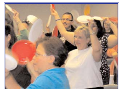
Corpus Christie TX