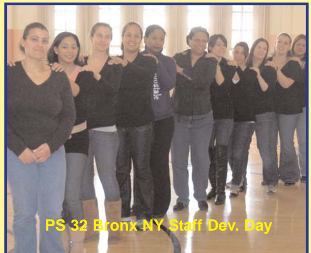
PS 32 Bronx NY Staff Dev. Day